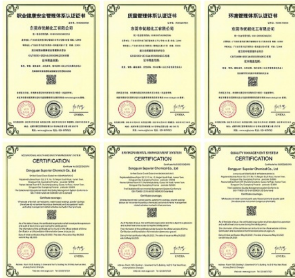
QUALIFICATION CERTIFICATE DISPLAY