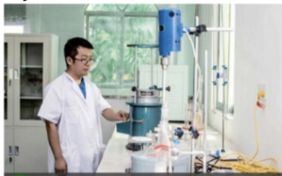
Professional Research Team