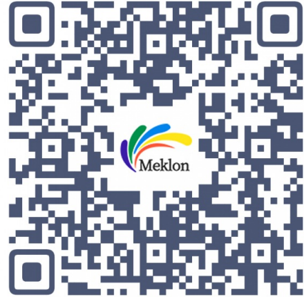
MeklonColorMix App (Android)