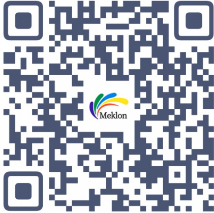
MeklonColorMix App (IOS)